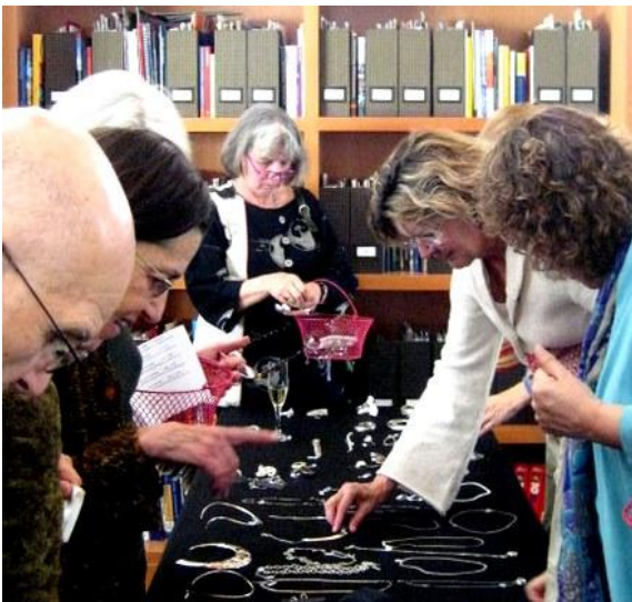
Shoppers perusing jewelry at the 2010 Jewelry Extravaganza.