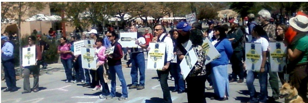
Supporters at the UNM Rally to ban corporal punishment in the schools.